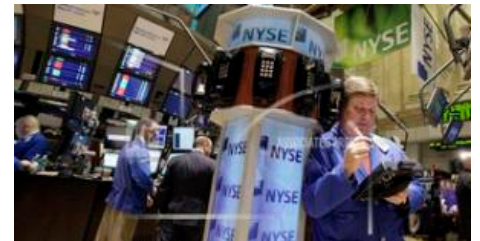
Why a rate hike is a good sign for stocks: CIO