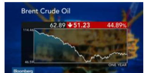
With An Oversupply of Oil, Expect Lower Prices: Gordon