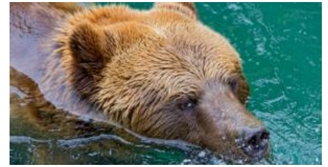
4 Signs of a Pending Bear Market