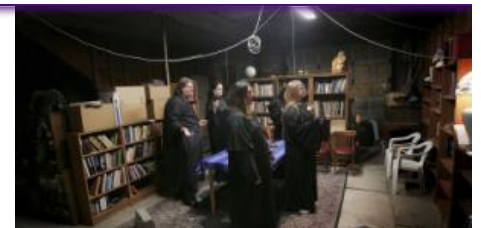
Weird Business News: Etsy angers witches, Buenos Aires needs clowns and ...

GE (GE) works on things that matter. The best people and the