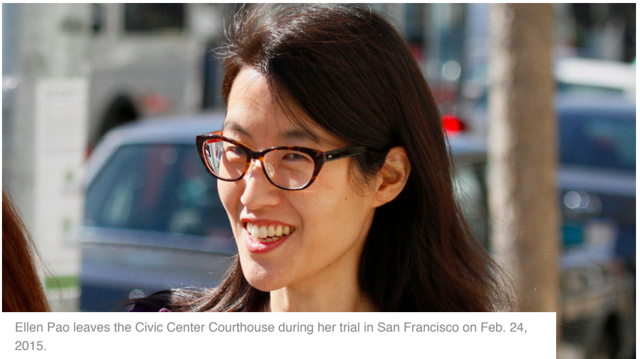
Ellen Pao leaves the Civic Center Courthouse during her trial in San Francisco on Feb. 24, 2015.